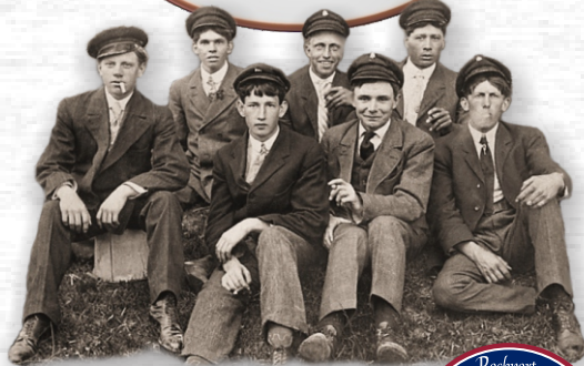
Rockport River Rats c1904